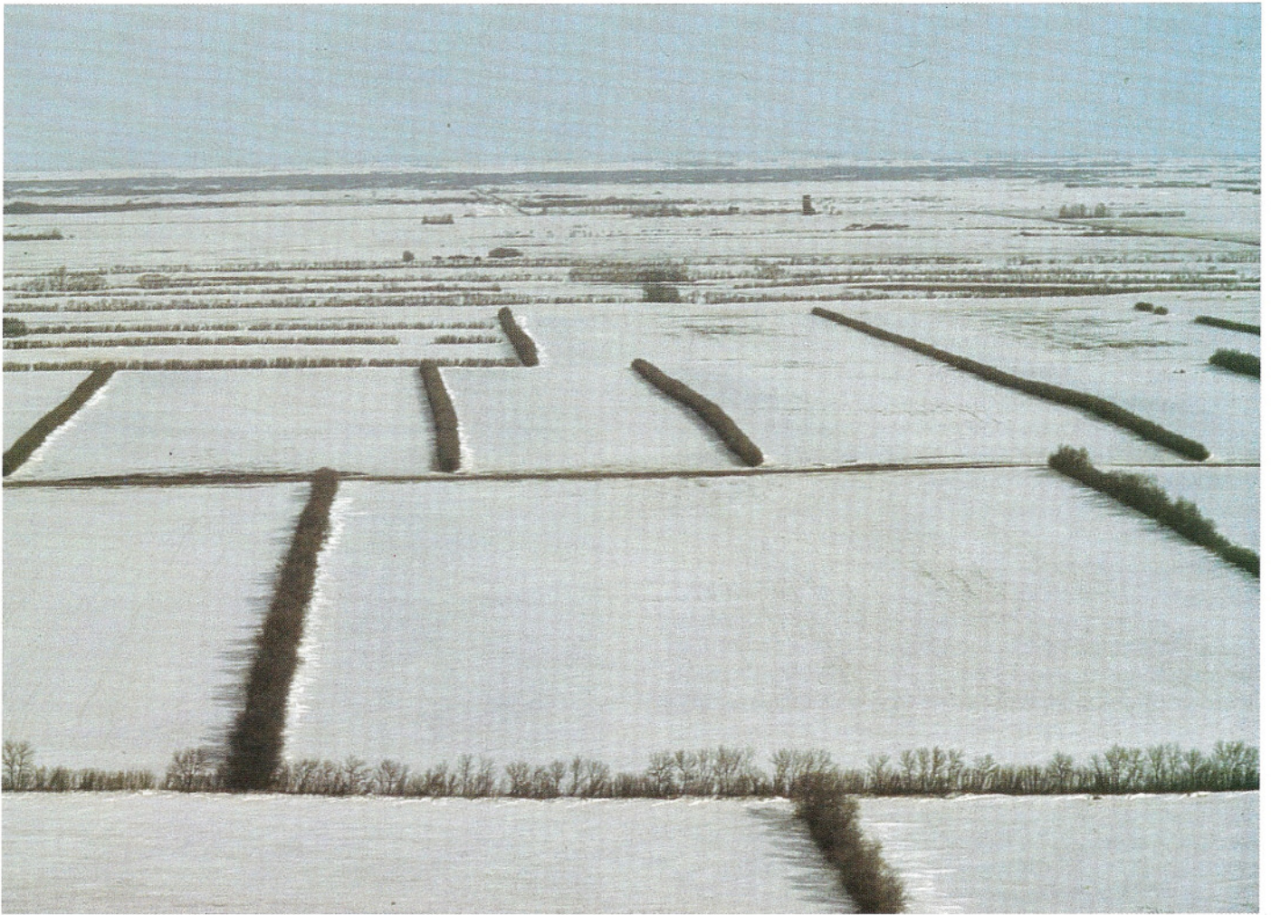
A windbreak across a large field distributes snow throughout the field, providing winter protection and moisture for crop production.

density. There is no one set design, number of rows, or width of planting that is ideal for every circumstance. The design of your tree planting should be done with your needs and winter conditions in mind. In some cases, landowners may choose to relocate fences, driveways, or feedlots in order to take full advantage of their windbreak. Remember, a tree planting is a long-term investment and it pays to consider all alternative designs before installation.