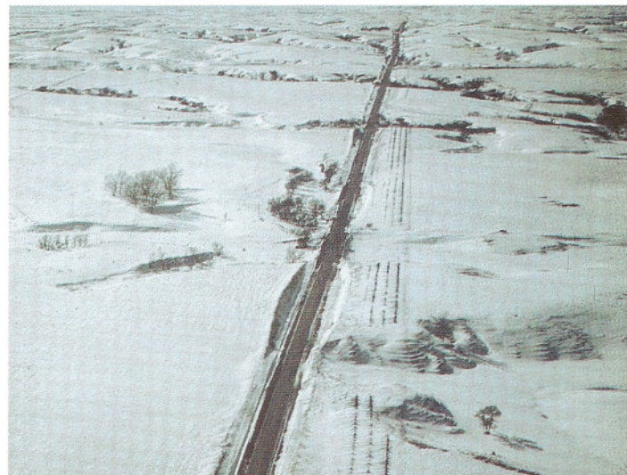
Living snowfences located along the north side of a highway will reduce time and energy costs associated with snow removal and improve winter driving conditions.

Areas or fields vulnerable to wind erosion during the winter offer additional challenges since field windbreaks with a density below 40 percent provide little protection for the soil resource. If the field is covered with snow the soil resource is protected, however, many areas where snow is an important source of water do not have continuous winter snow cover and therefore additional